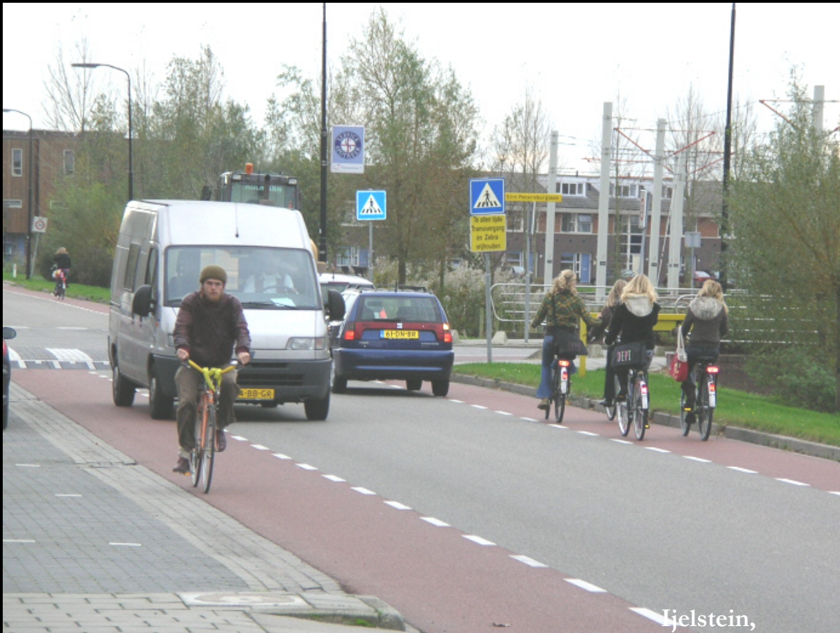
Lijelstein, The Netherlands